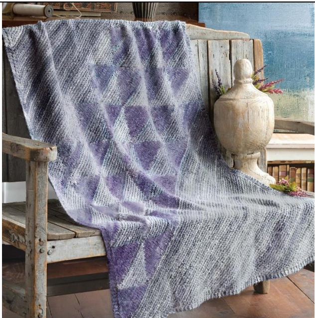
Shadow Angles Laura Zukaite

Knit in two colors of Tennen from corner to corner, this is a striking afghan. Very subtle and lovely. Would make a perfect summer weight throw in Noro Akari