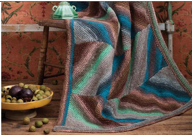
Chevron Throw – Grace Akhrem

I love how subtle the patterning and colors are and how light a fabric it is. Like the Cavendish, it's just the right weight to wrap up in, and I think Akari's tonal palette would be perfect.