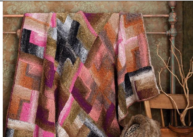
Patchwork Afghan – Dorcus Lavery

Modular squares with neutral border. This version uses the background color in the last bit of the square to create a cross motif, but it is equally pretty when the center sections are full squares. Shown in Silk Garden but could also be worked in Kureyon, Ito, Akari, or Tsubame.