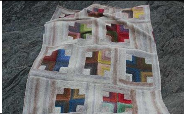
Mitered Crosses Kay Gardiner

Modular squares with neutral border. This version uses the background color in the last bit of the square to create a cross motif, but it is equally pretty when the center sections are full squares. Shown in Silk Garden but could also be worked in Kureyon, Ito, Akari, or Tsubame.