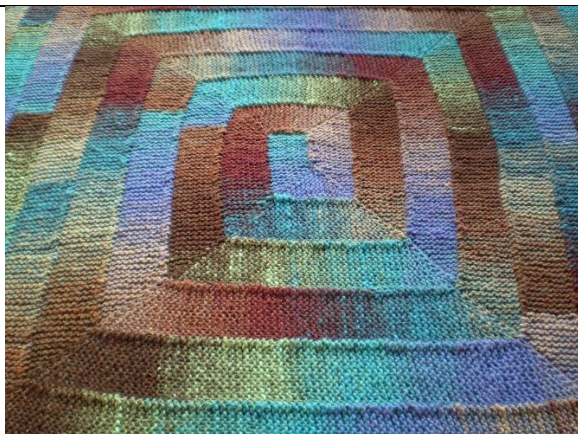
10 stitch blanket Frankie Brown

Large strips worked on the bias (increase at one end and decrease at the other end every other row) and then seamed in opposite directions to create a fun chevron shape. Modular strips like I like, but less seaming. Shown in Kureyon. Would also be lovely in Akari.